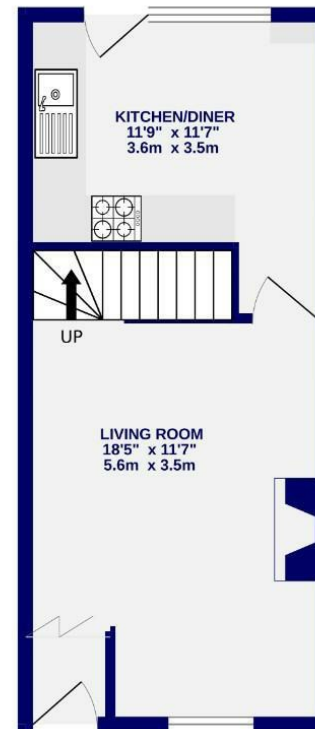
GROUND FLOOR 311 sq.ft. (28.9 sq.m.) approx.